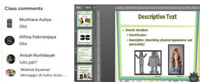
Picture 1. Reading Assessment on Google Classroom

Additionally, the results also presented reading assessment from online class on Google Classroom.