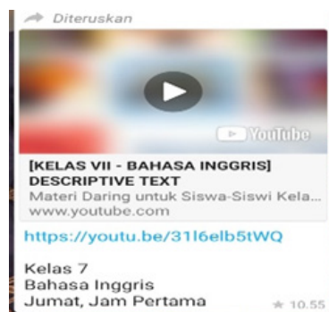
Picture 1. Teacher shared the link of material video

First, the teacher will create a PowerPoint slides contains of materials that will be deliver to the students. After the slides finished, she takes a video using Bandicam application to explain the material according to the slides she has created. The final video material will be sent in the form of file through Google Drive to the school operator to be uploaded into the schools' YouTube channel. After the video uploaded, the teacher shared the link of the video in their WhatsApp group so that students can access it from their place. The following picture is the documentation of the learning process: