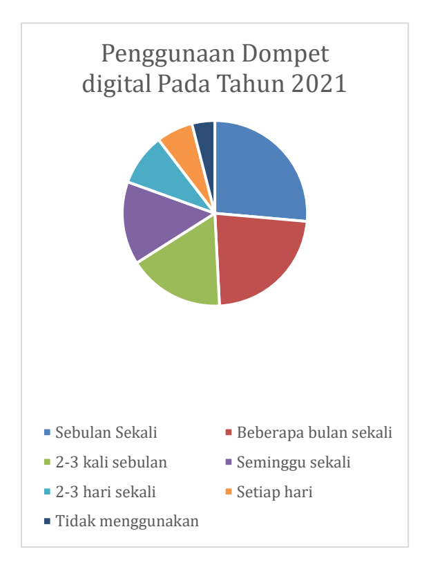
Figure 2. Digital Wallet Usage in 2021

A digital wallet or what we usually refer to as an e-wallet is an application that can be used to make payments online. This application is usually used with gadgets or smartphones, so we don't need a card or cash. The diagram above is secondary data which is the result of a survey of digital wallet usage in 2021 that was previously conducted. The results are as follows: 26.4% of the public access e-wallets once a month. In the second position, there are as many as 22.8% of people accessing digital wallets every few