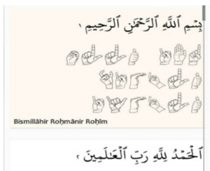
Figure 3 Bismillah Reading Using Hand Sign Symbols.

Deaf students memorize verses of the Qur'an and hadith by memorizing the arrangement of letters from a verse, as in the illustration in Figure 3.