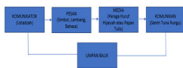
Figure 1 Cycles and Communication Patterns at Darul Ashom Islamic Boarding School Yogyakarta.

them initially cannot use sign language, but they eventually get used to it because all the students and ustadzah use sign language. The communication pattern among ustadzah and students becomes more in-depth because they are involved in various Darul Ashom Islamic Boarding School activities. The cycles and patterns of communication in the Darul Ashom Islamic Boarding School are presented in Figure 1.