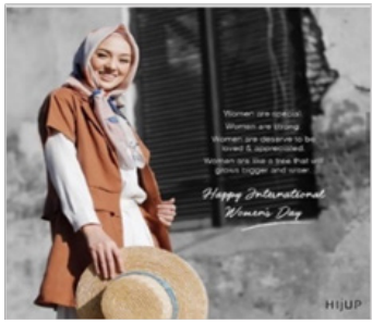
Figure 1. Several da'wah contents at HIJUP. COM

Figure 1 illustrates the appeal of the HIJUP.COM message on Instagram, which combines fashion with da'wah within the hashtag #EmpowerChange.