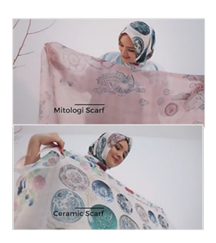
Figure 2. A veil with the theme "The Story of Caruban"

Second, Delftware Scraft Holland, the advantages of giving gifts. Third, the Chinese Scraft Mythology has about human nature to be worldly. Fourth, Phoenix Scraft contains about rising from adversity. Lastly, the Craft Sketch and the door design that express humility. The message from this product exposes the history of culture in Indonesia. The Indonesian culture has an exciting story and provides a philosophy of positive values.