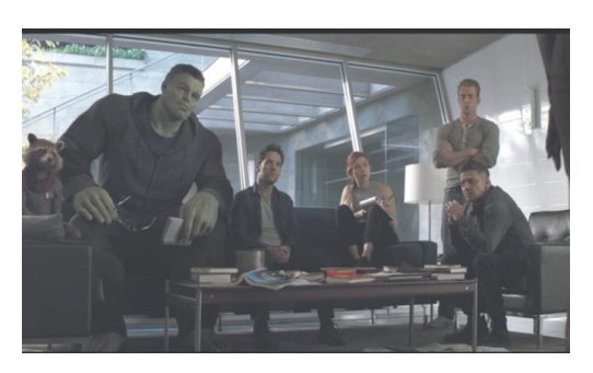
Figure 3 Black Widow and other characters

Meanwhile, Black Widow can be seen as the only person who takes note, as shown in Figure 3.