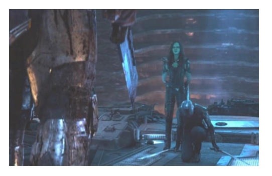
Figure 2 Gamora in dificult condition

Gamora is seen as strong and expert in combat; however, her narrative gave insight into her role in the film as an adoptive daughter to Thanos after he massacred her entire species and an adoptive sister to Nebula. Gamora possesses a protective role as Nebula sister, which can be seen in the film till 1 hour 15 minutes whereby Gamora quickly rushed to Nebula side when her brain malfunction as it was connecting to the time-travelling Nebula and stood in between Nebula and Thanos, then tries to justify Nebula sudden brain malfunction to avoid Thanos wrath, refer to Figure 2.