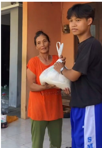
Figure 2. Documentation of Social Service Activities at Muhammadiyah Imogiri High School