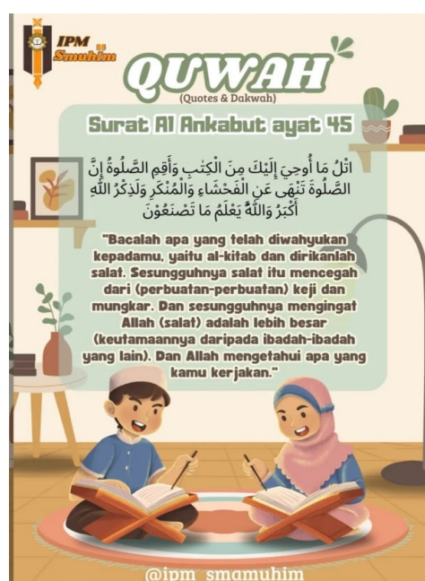
Figure 1. Documentation of Intracurricular Activities at Muhammadiyah Imogiri High School

In learning Fiqh, especially Fiqh Muamalah, by applying the approach learning by doing, from John Dewey who places direct experience as the basis for learning (Surahman & Fauziati, 2021). According to interviews with ISMUBA teachers, the Islamic jurisprudence ( fiqh ) of transactions in Islam, including the principles of honesty and trustworthiness in transactions, is discussed, for example, in the school cafeteria. In addition to classroom learning, supporting activities such as religious extracurricular activities and habituation programs also play a crucial role in strengthening spiritual values (Kholik et al., 2024).