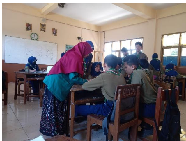
Figure 3. Research Activity

The control class applied conventional learning without the help of learning media to support learning activities. The experimental class implemented discovery learning with the help of the Pythagorean puzzle. The following is a picture of this research activity.