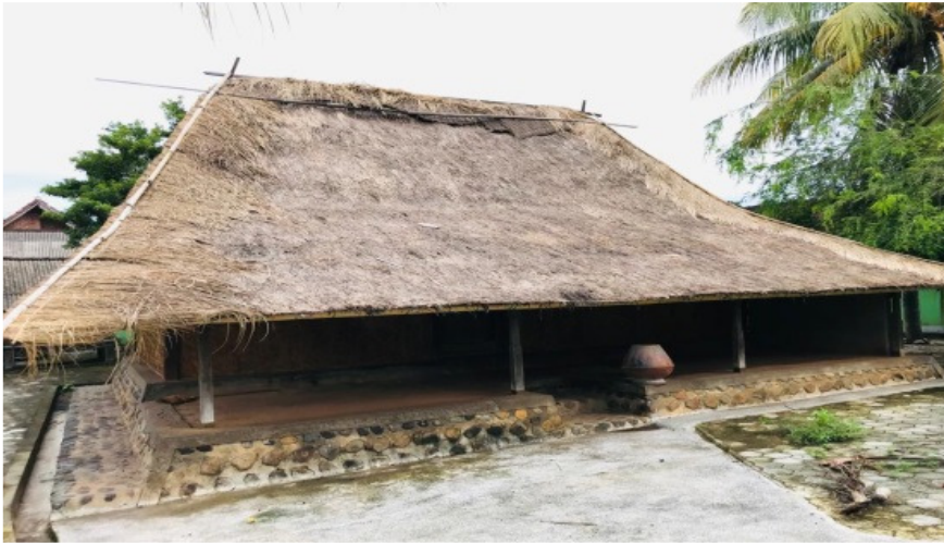
Bale beleg in Jerowaru Village