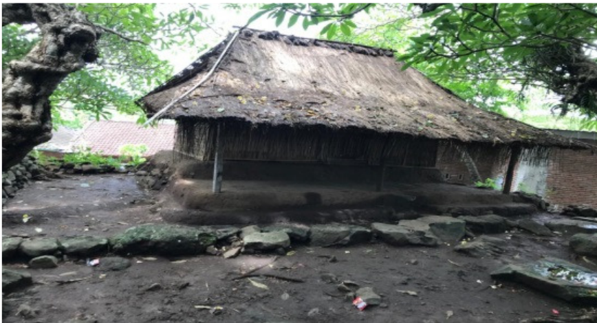
Bale beleg in Wakan Village