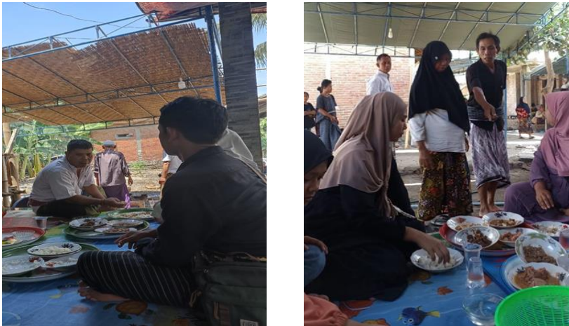
Procession of "begawe" in the Sasak customary marriage tradition

The practice of " begawe " is intended for expressing gratitude and celebrating the marriage that has taken place. For the Sasak community, " begawe " is not just a feast; it holds religious values and serves as a means to strengthen familial and community ties, fostering mutual assistance among neighbors. Hence, it is considered obligatory. Islam strongly advocates mutual aid and the strengthening of social bonds, as emphasized in the Quran, Surah An-Nisa, verse 36: " Worship Allah and do not associate anything with Him, and be kind to two parents, relatives, orphans, the poor, neighbors near and far, friends, travelers, and those your right hands possess. Indeed, Allah does not like those who are arrogant and boastful. "