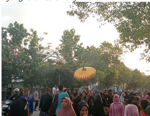
Figure 3 Nyongkolan Ceremony in Sasak Tradition

The tradition of Nyongkolan or wedding procession ( nyongkolan ) is commonly performed by sending off both bride and groom from the groom's house to the bride's house, accompanied by a procession involving family members, relatives, and the local community. Participants wear traditional Sasak attire, complete with traditional makeup, and the procession is accompanied by a musical ensemble, including the gendang bleq (large drum) and kecimol music. The purpose of this procession is to escort the groom to the bride's house. In the execution of merariq nyongkolan , negative behaviors are sometimes observed, such as the mixing ( ikhtilāt ) of men and women during the dance, excessive drinking, fights, disturbances to public transportation flow, and neglect of prayer, usually during the call to prayer ( azan ). The atmosphere during the implementation of the Nyongkolan tradition in the Sasak community, conducted by the two bridal couples in Figure 3.